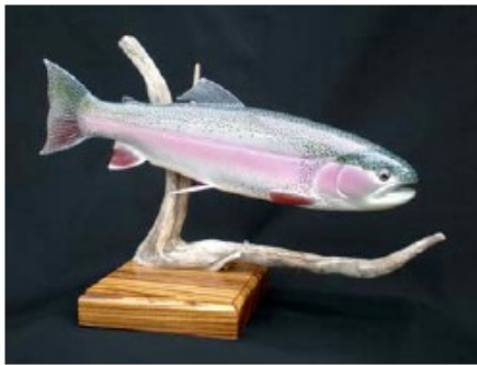
Rainbow Trout