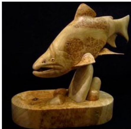
For this seven-inch Tiger Trout, I used a maple burl which increased the level of difficulty.