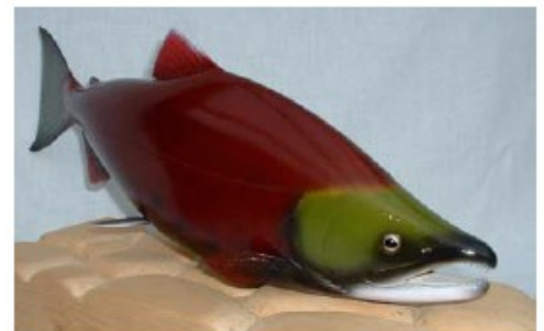
Sockeye Salmon