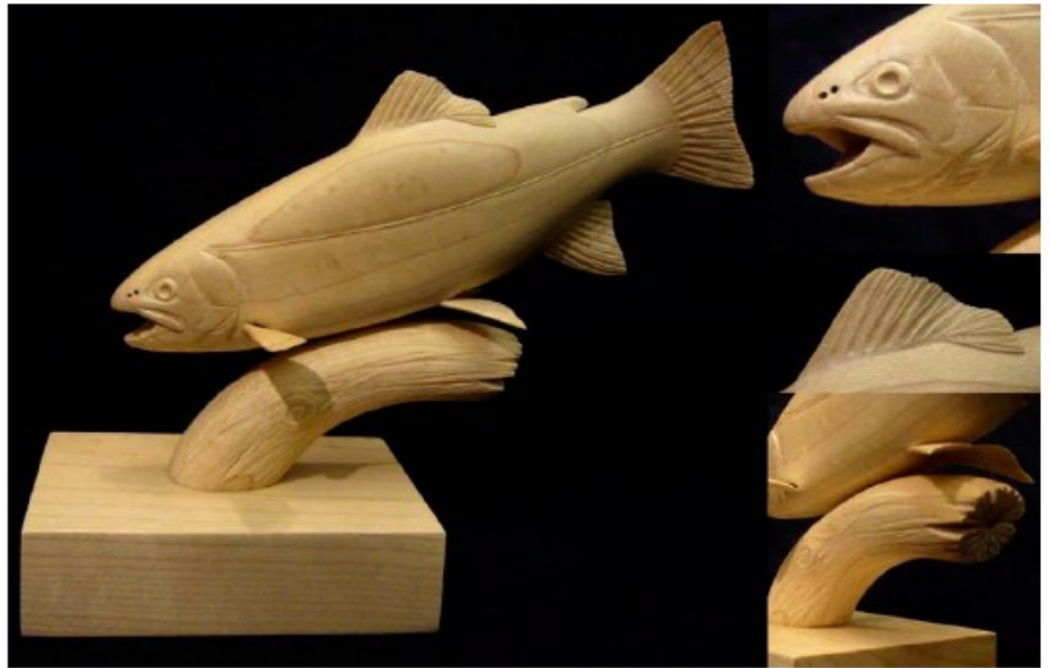
I used birdseye maple for this six-inch Trout. The smooth, steady grain and the hard, dense structure of the wood allowed for good detailing of the head and fins.