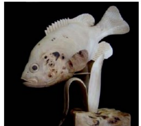
For this six-inch Green Sunfish, I chose cottonwood. It's very light weight and easy to carve, but difficult sanding to a smooth finish.